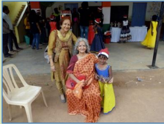
Participation in volunteering activity of Danske IT@ Pathanur Govt. school