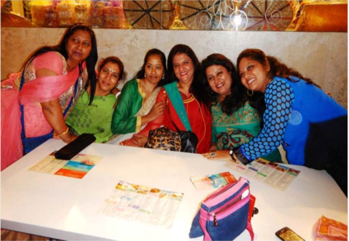
From Mumbai with Love

Team Mumbai was fun, enthusiastic and almost magical. Professional and well organized, the team presentations have left a strong imprint on rest of the members. We all have lot to learn from team Mumbai specially on Volunteer Management.