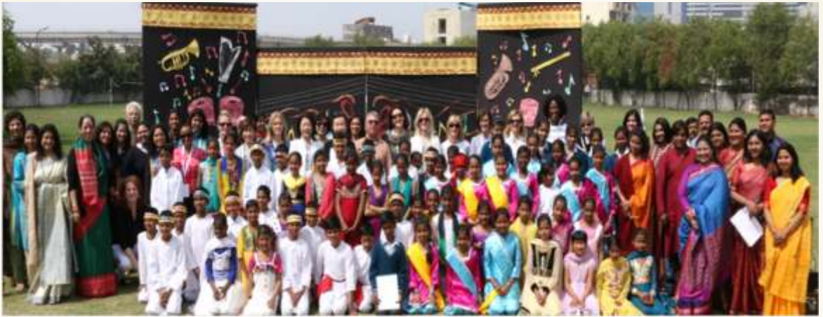
Thank you KPMG for Giving VIDYA the Wings to Fly

Later, the five scholars of KPMG visited the First World War Centenary celebrations organized by the Indian Army at Delhi Cantt. The students gained many insights into India's participation in the First World War.