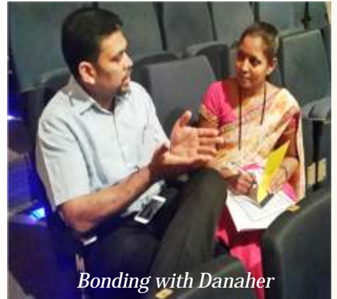
Bonding with Danaher

Danaher, a US based company arranged a fun filled evening for students of Beyond School and Youth forum. There were street plays on gender sensitivity followed by experience sharing by alumni. One group of leaders had a one to one mentoring session with the youth. The younger students also bonded comfortably with the team.