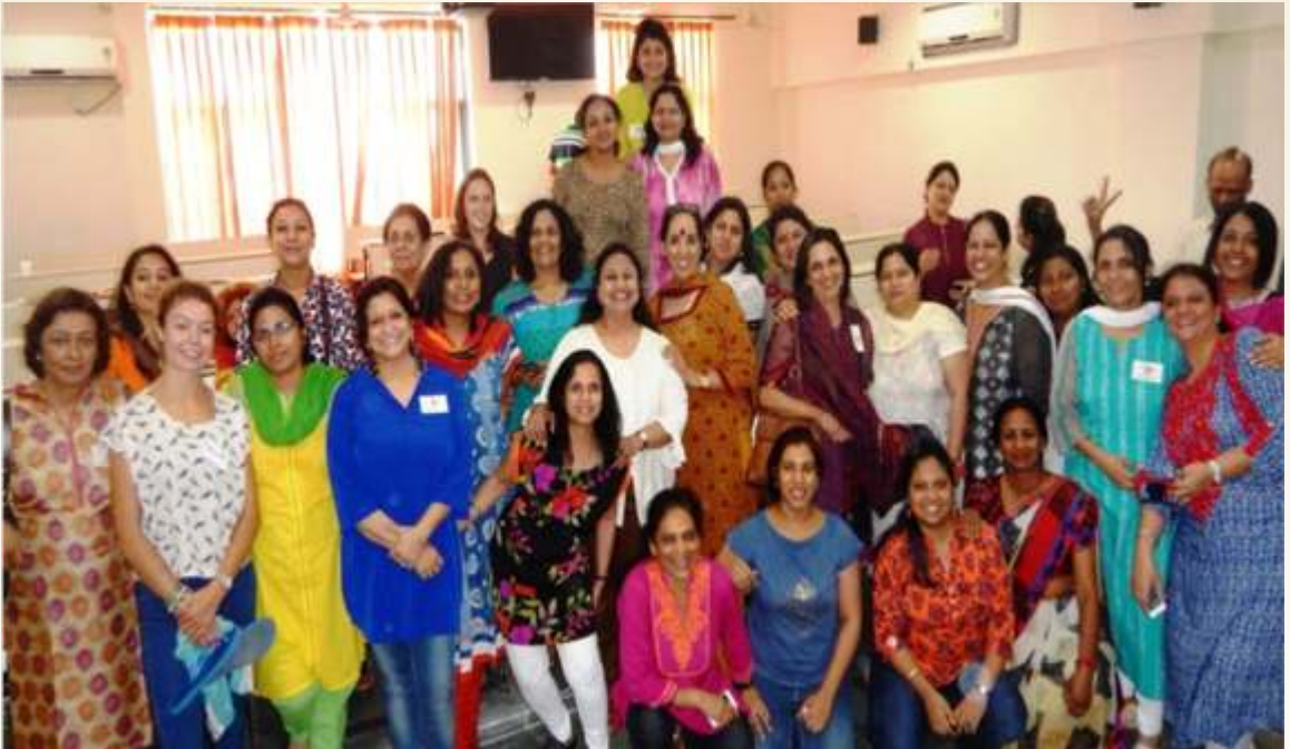
Kudos to Delhi Team for Successfully Handling the Conclave