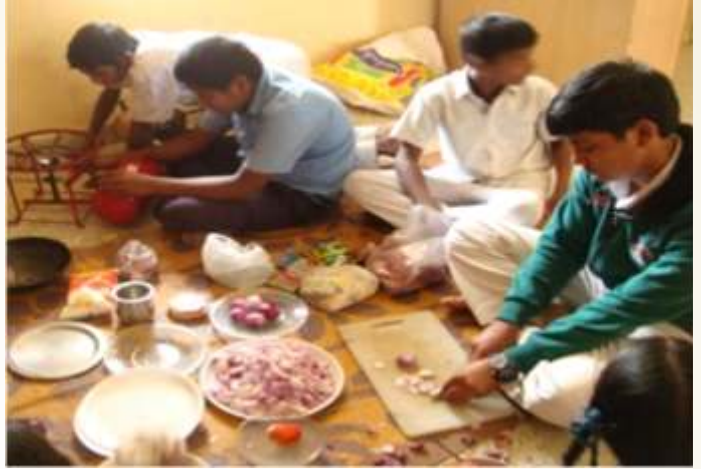
Boys had a Blast Preparing the Dishes

In Bangalore, a life skills workshop in Gottigere High school was the monthly event to mark the 30 years celebrations. After a two weeks toil, the final result was a fantastic array of food platter from South India. As new learning, Chinese food was also included.