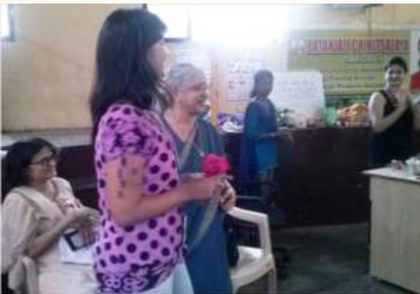
Women- the Enablers

cooking workshop was conducted and special gifts were arranged for the partic across all the community centres. A cooking workshop was conducted and special gifts were arranged for the participants