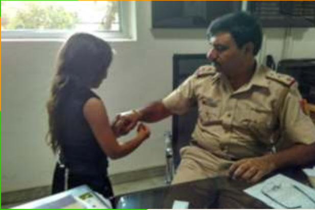
Caring Cop...Girl Child's Hope

Rakshabandhan is a festival that upholds a woman's dignity and provides protection...it is a sacred bond of affection between brother and sister. This festival is regularly celebrated in VIDYA's Institutions.