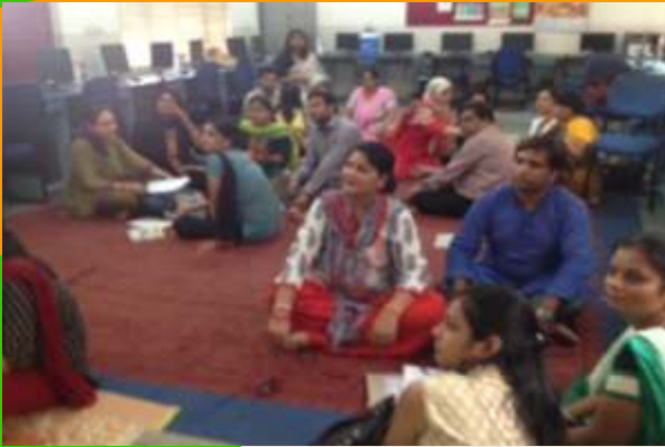
Efficient, Effective, Enterprising