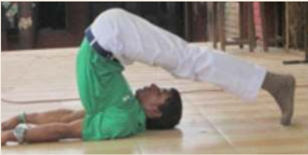
Gaga over Yoga

In IIT-NSS programme, the Independence Day provided a platform for students to showcase their talent through various cultural presentations.