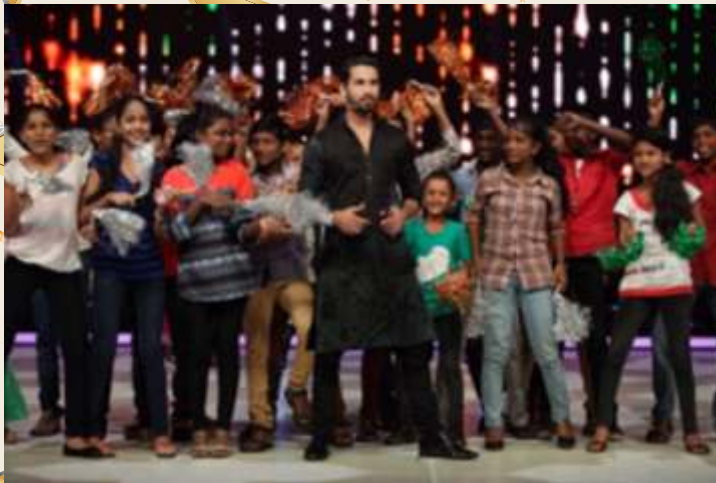
Shining with Shahid Kapoor, the Famous Movie Star.

Bhavishya Yaan students from the G K Marg Municipal School were fortunate to visit the sets of the famous dance reality show "Jhalak Dikha Jaa" which is aired on Colors Channel. Their enthusiasm was palpable as they sang, danced, laughed and talked all the way throughout the journey to the set of the show. They were exceptionally curious and eager to meet Shahid Kapoor who was the Star Judge of the show on that day. Upon reaching the sets, children settled with bated breath as they saw the host, celebrity judges and the contestants of the show. They were thrilled and awestruck to be able to share centre-stage with such a huge star. A guest appearance by actors Saif Ali Khan and Katrina Kaif was the icing on the cake.